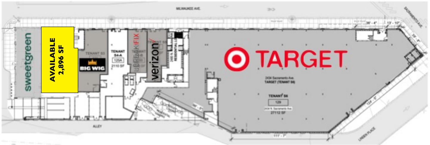
1 LEVEL 1 - BUILDING B 1" = 30'-0"